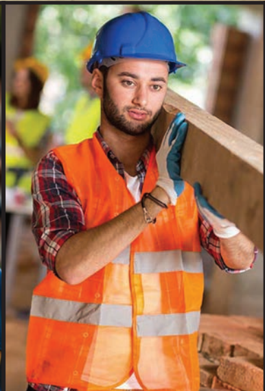
CONSTRUCTION WORKER Dꞑꞑꞑꞑꞑ