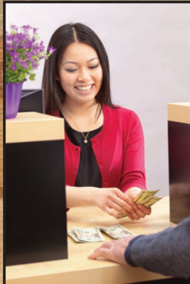
BANKER DSW ꞑhꞑT DSWꞑ

GWYA DꞑP CHEROKEE NATION GWY Dhwꞑw OꞑVPR CHEROKEE LANGUAGE PROGRAM