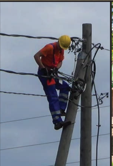
ELECTRICIAN Dꞑꞑꞑꞑꞑ ꞑꞑꞑꞑꞑꞑ