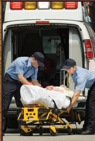
PARAMEDIC ꞑꞑꞑꞑꞑꞑ ꞑꞑꞑꞑꞑ