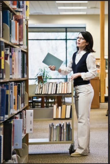
LIBRARIAN ꞑꞑꞑꞑꞑꞑꞑꞑꞑ Dꞑꞑꞑꞑ