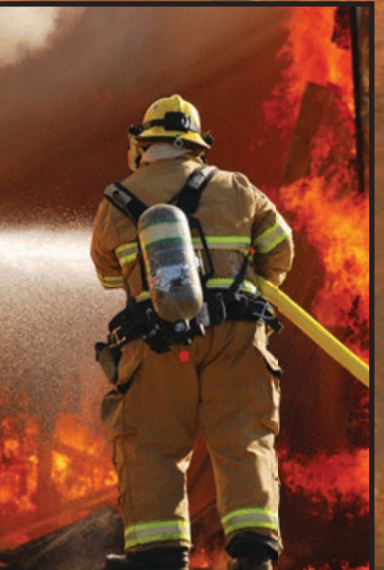
FIRE FIGHTER Dꞑꞑꞑ ꞑꞑꞑꞑꞑ