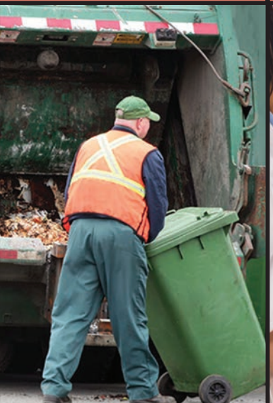
TRASH COLLECTOR ꞑꞑꞑꞑ ꞑꞑꞑꞑꞑꞑꞑ