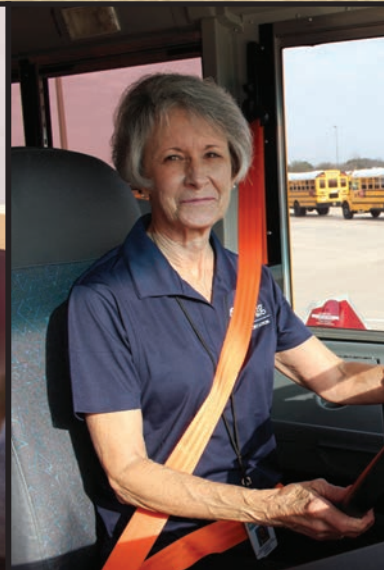
BUS DRIVER ꞑꞑSGTꞑw ꞑꞑhVA