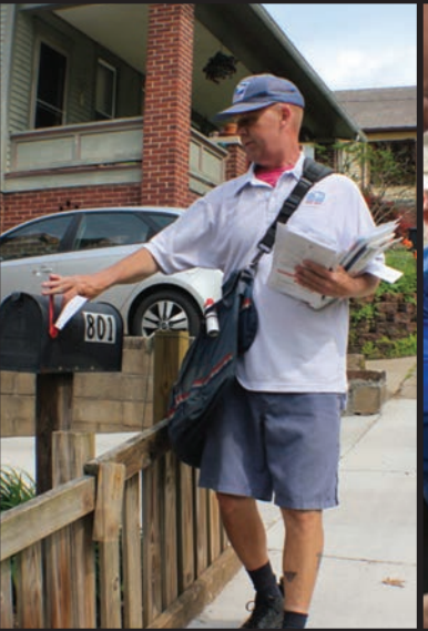
MAIL CARRIER Aꞑꞑꞑ ꞑꞑꞑꞑꞑ