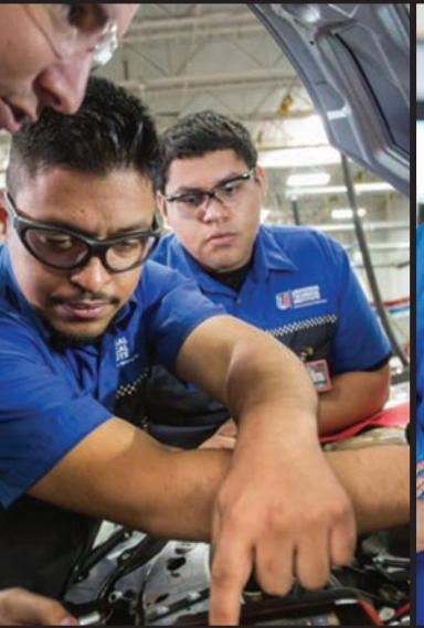
MECHANIC Vꞑꞑꞑꞑ ꞑꞑꞑꞑ hꞑꞑꞑꞑ