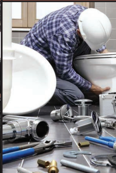
PLUMBER Dꞑꞑꞑ ꞑꞑꞑꞑꞑꞑ ꞑꞑꞑꞑꞑ Tꞑꞑꞑꞑꞑ